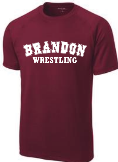
#4 Maroon Tee Short Sleeve

Embroidered Heathered Look Maroon/Black Beanie $14.00