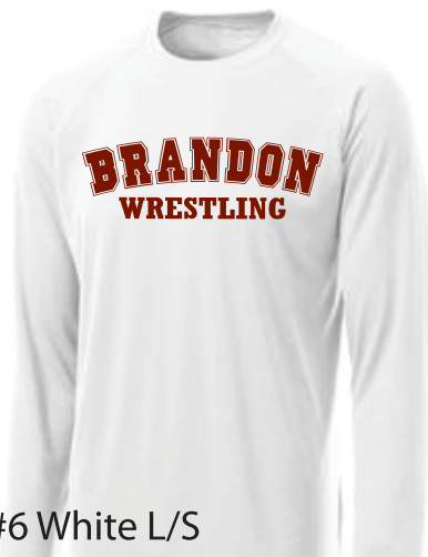
#6 White L/S